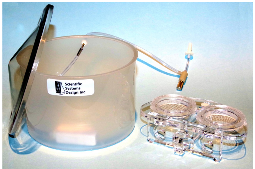
BSK5-2 Brain slice keeper with rings and net in place and with purpose designed container with lid to side. A needle valve is used to control the flow of oxygen mixture to the air-stone.

In operation, the manifolds carrying two rings each are located in the base of the holding vessel and are partially immersed with ACSF by filling to the level of the netting. The purpose-designed holding vessel is supplied with a 95% O 2 , 5% CO 2 gas mixture via a ceramic bubbler. The ceramic bubbler is located to the side or in a central space between the two manifolds when a four ring version is used. The bubbles rising from the base saturate the ACSF and provide constant circulation of medium to the slices from the underside. Typically slices are placed on lens tissue which rests on porous membrane discs attached to the netting. Bubbles are prevented from rising and being trapped under the slices by the half cylinder deflector, thereby ensuring a continuous circulation of medium. Slices remain viable for many hours in these conditions. The BSK5 together with the holding vessel can be easily placed into a water bath for regulating the incubating temperature as desired. A lid with a conical profile ensures that condensation drops do not fall directly on top of the slices. The typical fluid volume with BSK5-2 is around 250ml and reduced further with BSK5-4 where two manifolds are utilized.