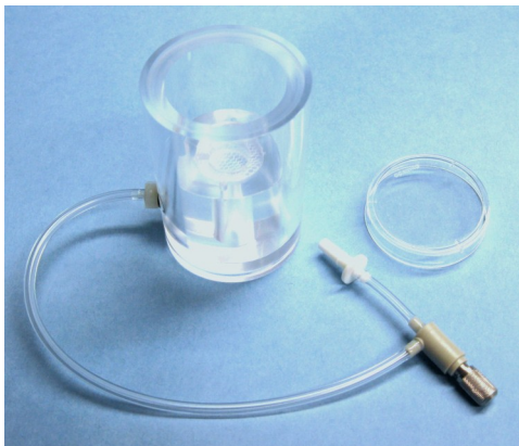
BSK2 Components - chamber with insert in place, needle valve gas flow regulator and lid.