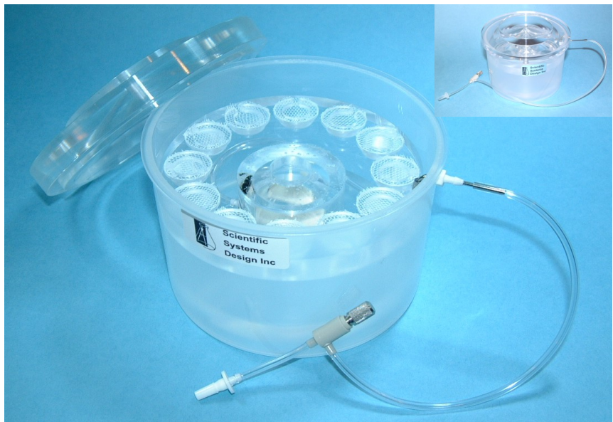
BSK12 Brain slice keeper with rings and net in place and with lid in place (inset). A needle valve is used to control the flow of oxygen mixture to the ceramic bubbler.

In operation, the twelve rings located on a manifold with netting are totally immersed in an ACSF-filled purpose designed holding vessel into which a 95% O 2 , 5% CO 2 gas mixture is supplied through a ceramic bubbler. The ceramic bubbler is located in a central tube chamber connected to the upper manifold. The bubbles rising from the base saturate the ACSF and provide constant circulation of medium to the slices which rest on the nylon nets. Bubbles are restricted to rising in the central chamber and are prevented from being trapped under the slices, thereby ensuring a continuous circulation of medium. Slices remain viable for many hours in these conditions. The BSK12 together with the holding vessel can be easily placed into a water bath for regulating the incubating temperature as desired. A lid with a conical profile ensures that condensation drops do not fall directly above the slices. When in place, the fluid level is maintained at least 3mm above the 'C' rings. This ensures circulation of fluid over the top and downwards towards the slices. The typical fluid volume with BSK12 is 500ml but can be reduced by adding large glass spheres into the base.